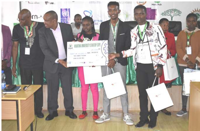
A cheque worth Kshs 300,000/- was also issued

The top three winning groups received a cheque worth Kshs 100,000/- each and other goodies.