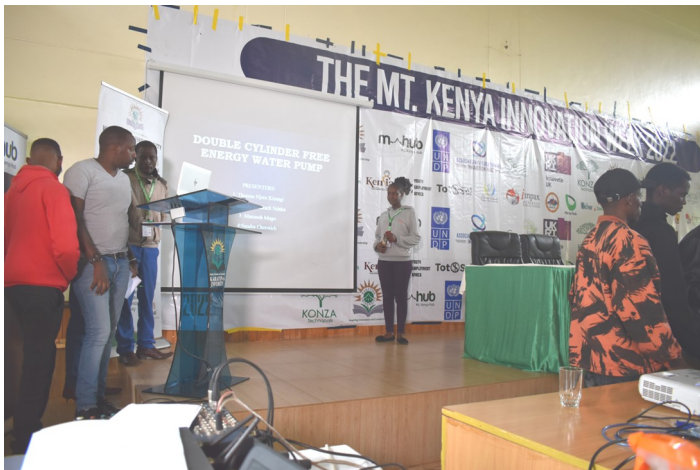
Student innovators presentation