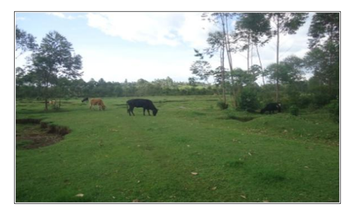
Plate 1: Free range cattle grazing in Sironga wetland

The results from the study indicated that 89 percent and 83 percent of the respondents from Sironga and Nyabomite areas respectively as observed in Table 3, drained wetlands for both settlement and crop production. Animals raised by the inhabitants included exotic and indigenous cows, sheep, goats and donkeys. The most common cattle breed is zebu animals and some mixed breeds. An interesting observation made during the study was the free range grazing of cattle in the wetlands (Plate 1). Overgrazing by livestock on wetland land usually has a negative impact on the environment as the animals overgraze and deplete the vegetation cover. Some animals such as donkeys are used as a mode of transporting roasted bricks to the road sides for easy transportation by Lorries and tractors to places of high demand. The increasing numbers of marginalized people were moving and settling in fragile wetland areas in search of new sources of livelihoods.