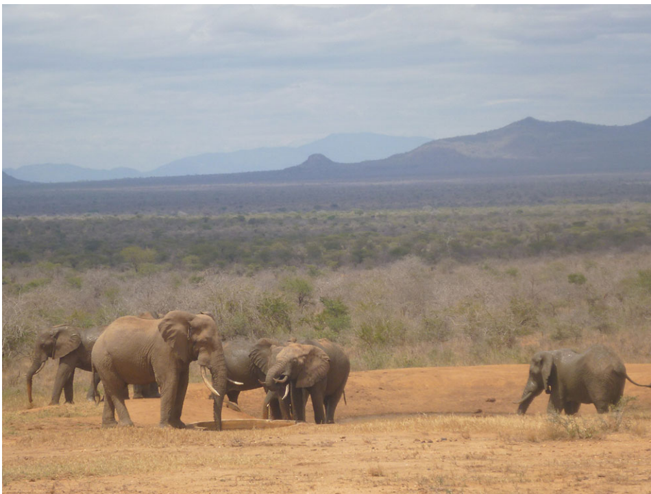
FIG. 2—Landscape with elephants in foreground and inselbergs in background. (Source: Photograph by the authors, June 2015).

Low elevation plains punctuated by inselbergs—steep, isolated hills—characterize Tsavo (Figure 2). Savannah covers the lowland plains, with open grassland in some zones but mainly a patchy mixture of grassland, shrubland, and open woodland dominated by thorny, drought-tolerant acacia and myrrh species ( Acacia spp., Commiphora spp.). Compared to the plains, the hills have higher precipitation and deeper, more fertile soils that support montane